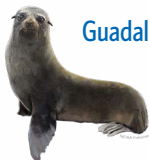
Guadalupe Fur Seal