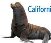
California Sea Lion