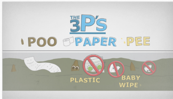
Only the 3Ps in the sewer system

What are some of the positive impacts on our local environment of the following stages of wastewater treatment?