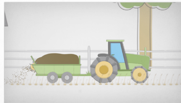
Biosolids used by local farms